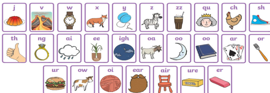
Phase 3 Sound Mat

Look at the Phase 3 Sound Mat below, you can use this mat to check if your child can produce the sounds correctly.